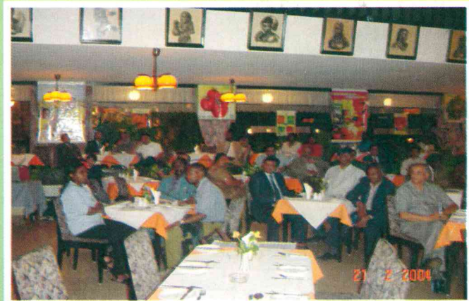
Distributors during the Top Distributor Prize Award dinner.