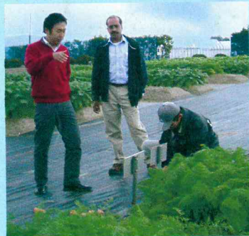
A Visit in Nov. 2003 to Tokyo, Japan with a representative of Takii, observing Cabbage Trials.