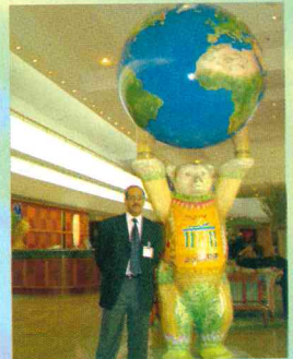
May 2004, ISF, Berlin, Germany.